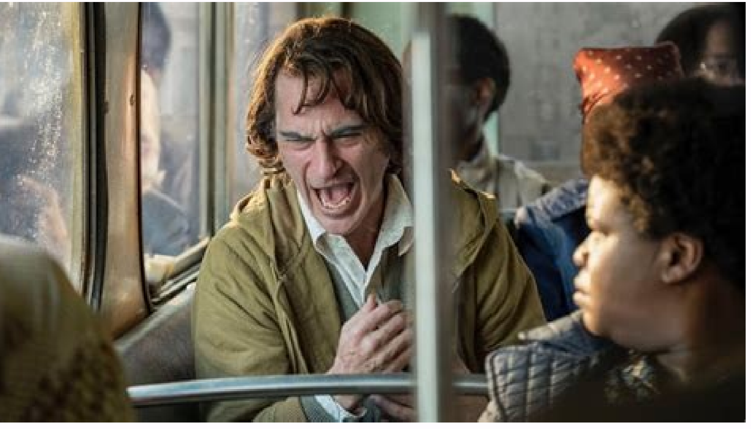
What is the joker's philosophy. Harley Quinn vs. the joker watch online free. Watch the joker online free uk. The joker watch online free reddit. Watch the joker online free dailymotion. What is the joker's intention.