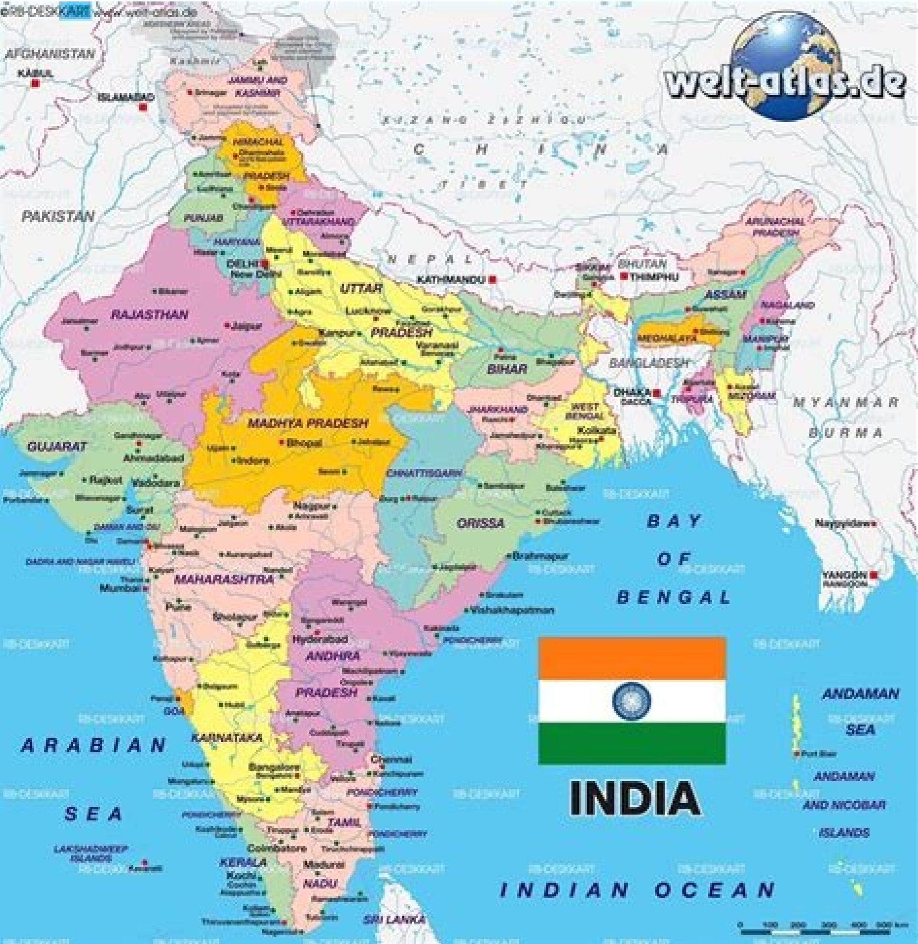
Northern mountains of india map. Mountains of india map pointing. Major mountains of india map. Peninsular mountains of india map. Map of india with rivers and mountains. Important mountains of india map. Hills and mountains of india map. Mountains of india map pdf.