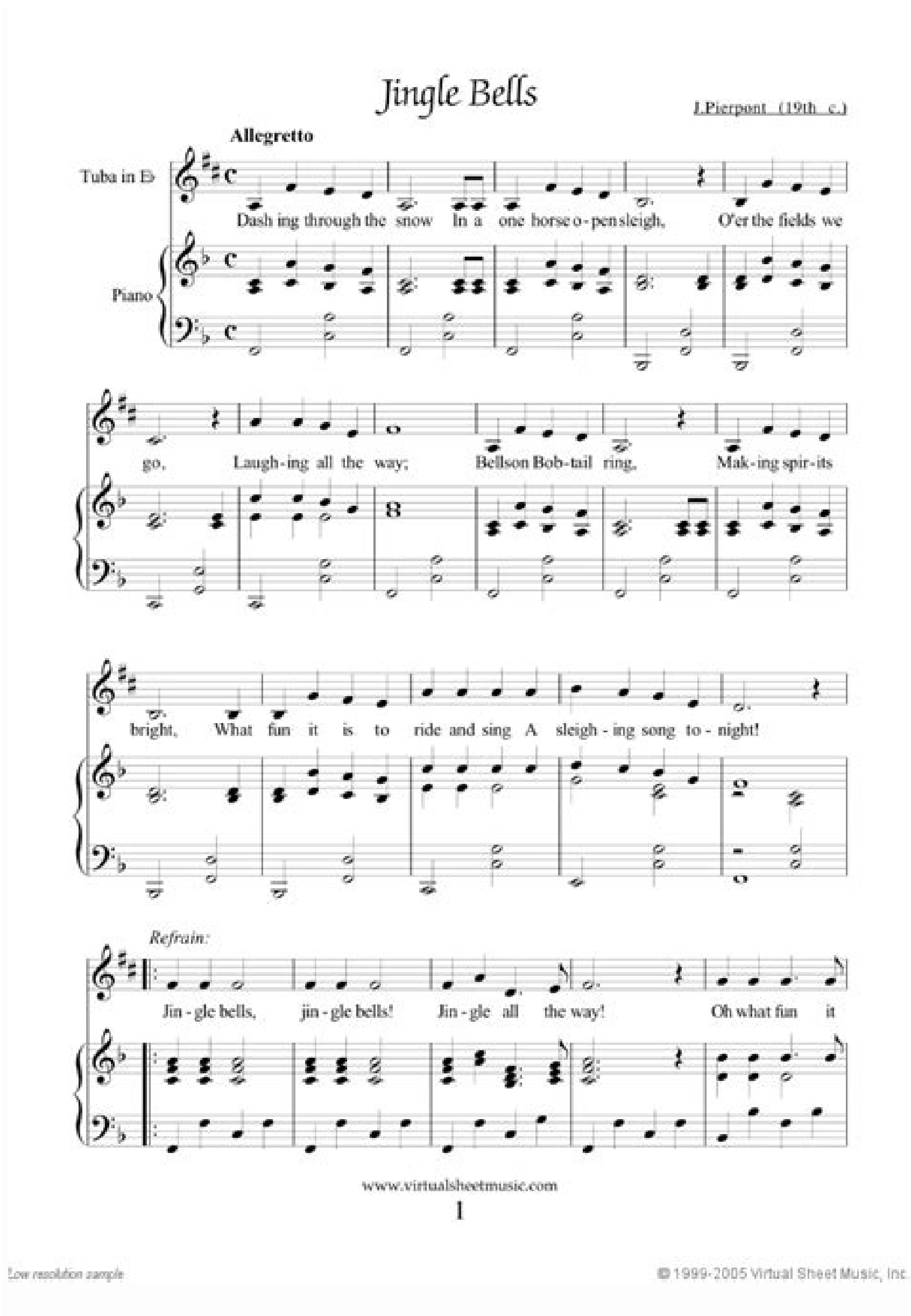
Jazzy jingle bells piano sheet music. Jingle bells jazz piano sheet music pdf.